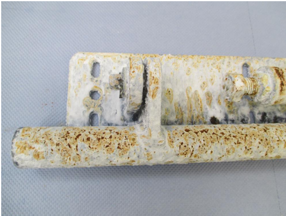
Fig 7: Photograph showing the condition of the Sample after 672 hours Salt Spray Test