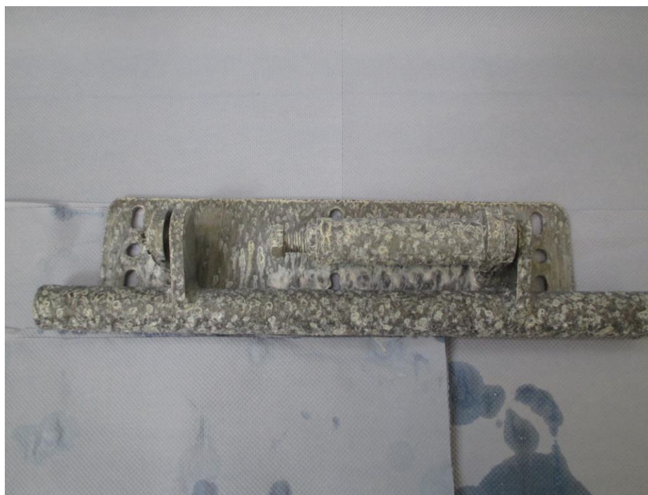
Fig 2: Photograph showing the condition of the Sample after 72 hours Salt Spray Test