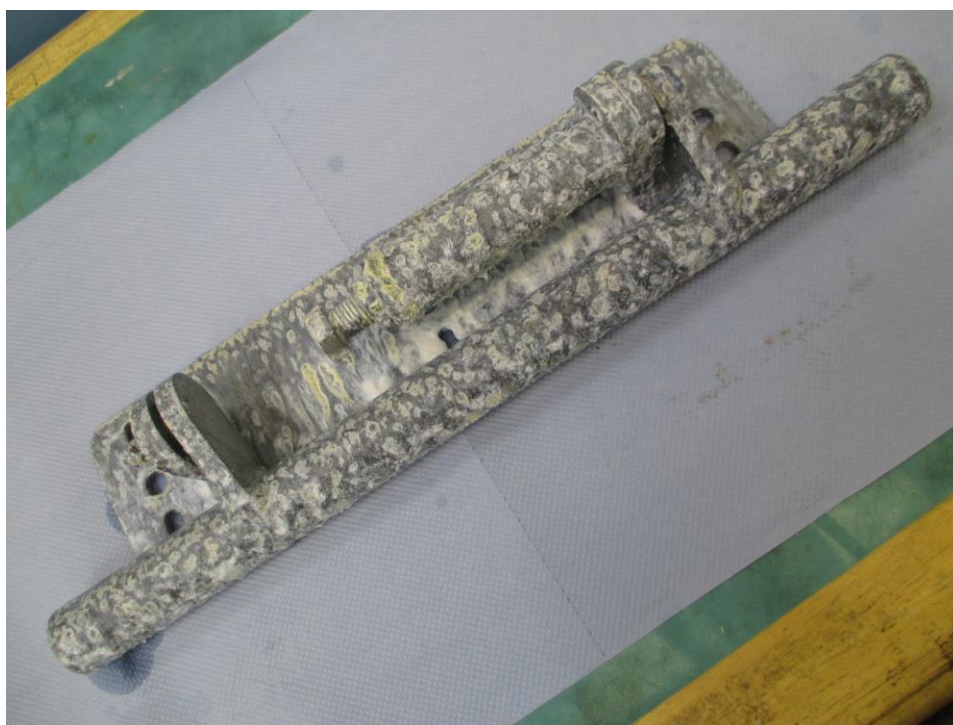
Fig 3: Photograph showing the condition of the Sample after 144 hours Salt Spray Test