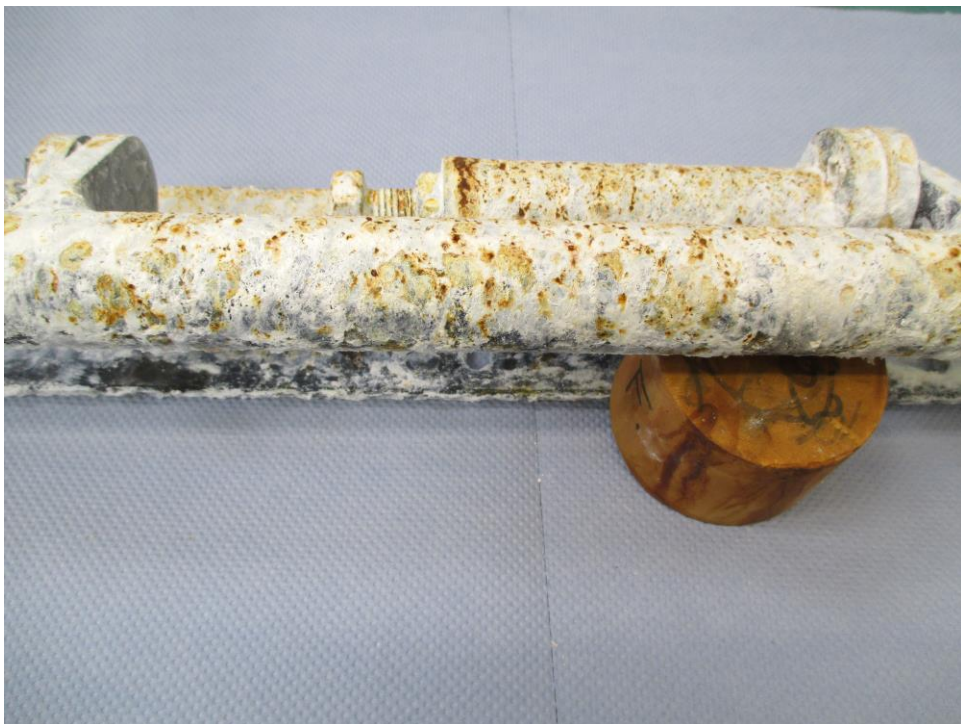
Fig 8: Photograph showing the condition of the Sample after 672 hours Salt Spray Test