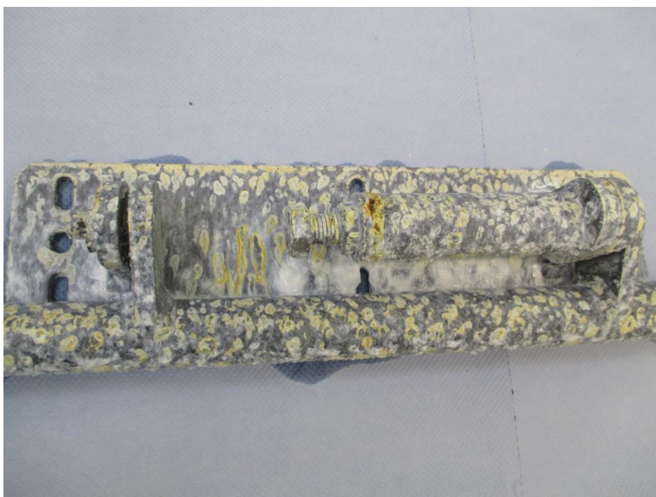
Fig 4: Photograph showing the condition of the Sample after 240 hours Salt Spray Test