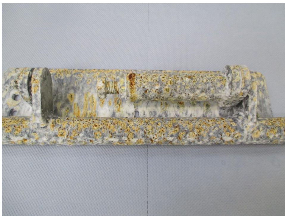
Fig 6: Photograph showing the condition of the Sample after 504 hours Salt Spray Test