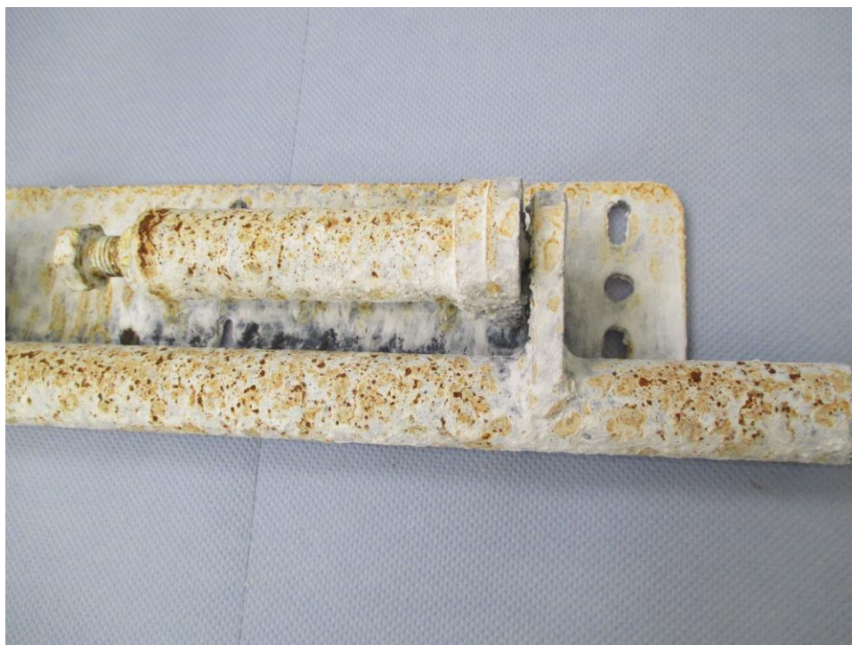
Fig 9: Photograph showing the condition of the Sample after 672 hours Salt Spray Test