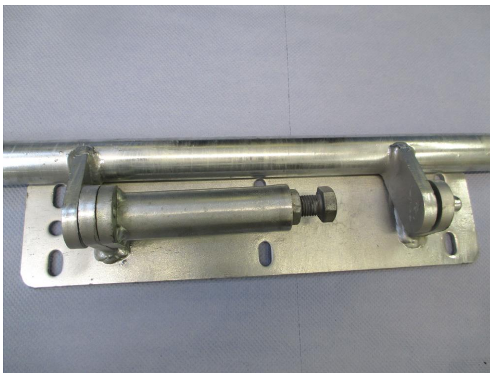
Fig 1: Photograph showing the condition of the Sample prior to Salt Spray Test