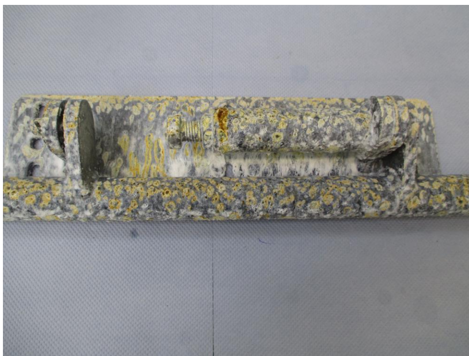
Fig 5: Photograph showing the condition of the Sample after 336 hours Salt Spray Test